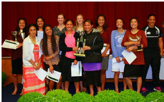
Senior Girls Basketball Team Sports Team of the Year