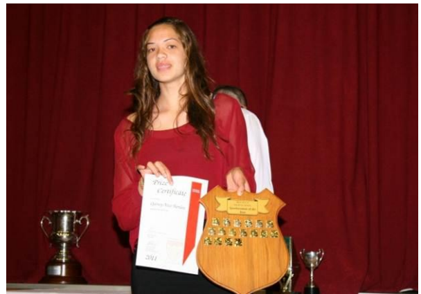
Quincy-Alice Sportswoman of the Year