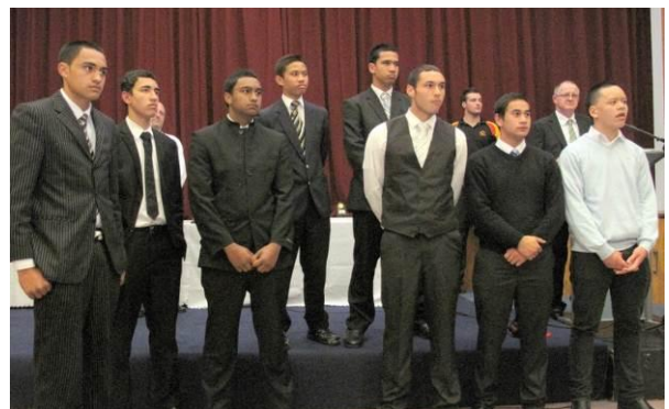
Senior Boys' Premier Basketball Team Sports Team of the Year