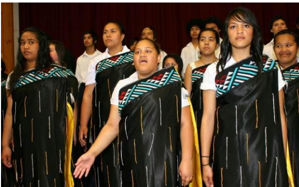
Kapa Haka Group performing with grace