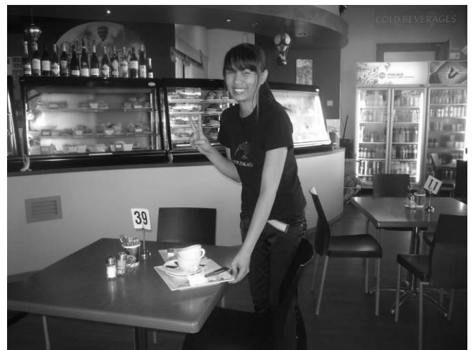
Trudes took up the opportunity to work at Café Strata