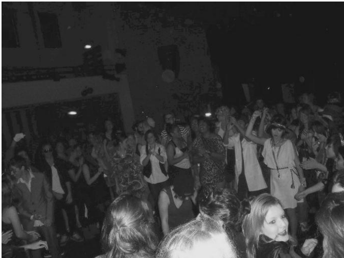
SADD students from all over NZ enjoying their time at the SADD Influential Disco

We also attended the "Victims Panel", where we heard from a mother whose daughter was killed by a woman drink driving, a girl whose sister was killed by a woman drink driving, and a man who was involved in two different major crashes, both caused by drink driving. This was a sad and eye-opening moment for everyone, as we heard from people who had experienced the effects of driving drunk first hand.