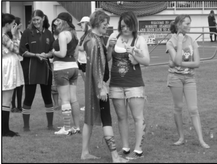
Students dressed in colourful costumes