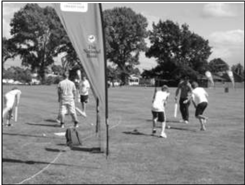
Shane Bond coaching young enthusiasts