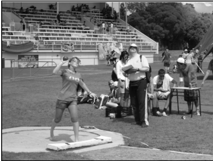
Discus throwing for House points