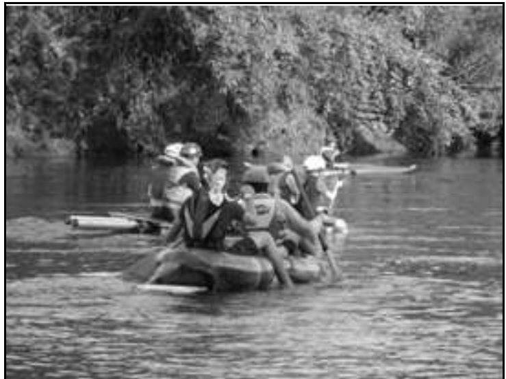
Great memories of Melville's 2008 raft race