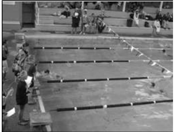
Competitive events produced some great results

Well done, everyone – it was a day full of fun!