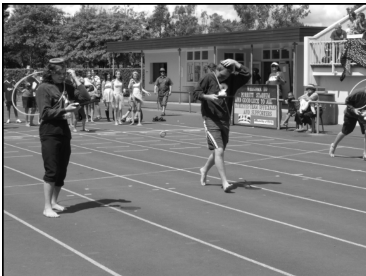
Fun and laughter in the novelty races

Once again we had a fantastic turnout for the school's athletics day at Porritt Stadium. There were over 200 individual competitors during the day which was double the participants we had two years ago. Chanting and support around the stadium was amazing along with the great sea of colour floating in the spectators' stand representing the Houses.