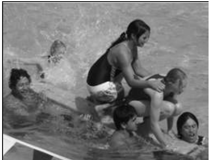
Now the fun start!