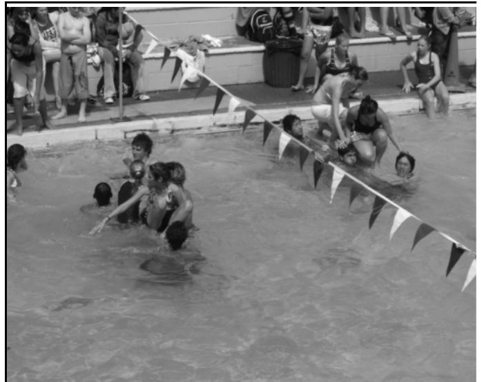
And even more fun and points to be gained!