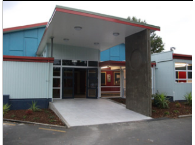
New entrance to Administration Block

Several community members and parents took up the offer to wander-and-view through the building prior to the formal ceremony. We were fortunate to have the services of senior student leaders who acted as guides for the guests and as chefs for the barbecue meal which was provided at the conclusion of the celebrations.