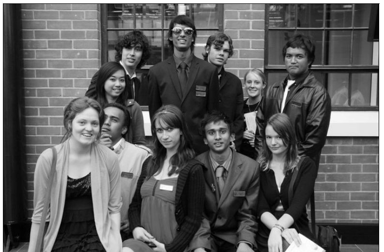
Melville High School Senior Leaders in their formal suits and dress

I was proud of the amount of people that showed up in our 'formal' theme, how we represented our school and the way that we made Melville spirit recognisable once again. There was also a dance off between Melville and Fraser students.