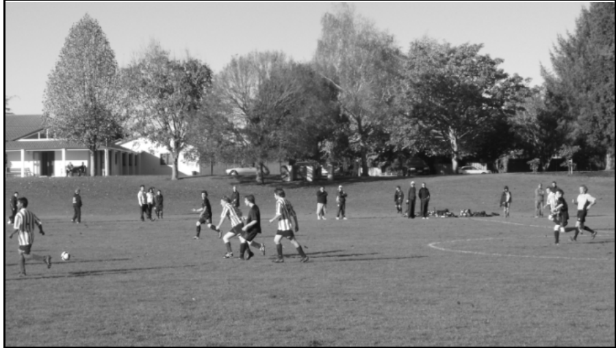
Boys' 1 st XI playing St Peter's School

All four Football teams are playing in very even competitions and the Melville teams are proving to be very competitive. The Boys' 1 st XI is competing in Division 2 and after three rounds there was only one team that had not had a win. The feature game for Melville was beating the previously