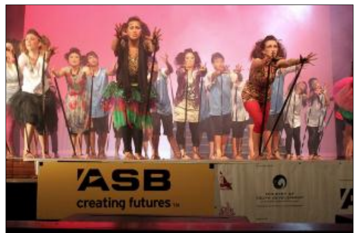
A classy performance