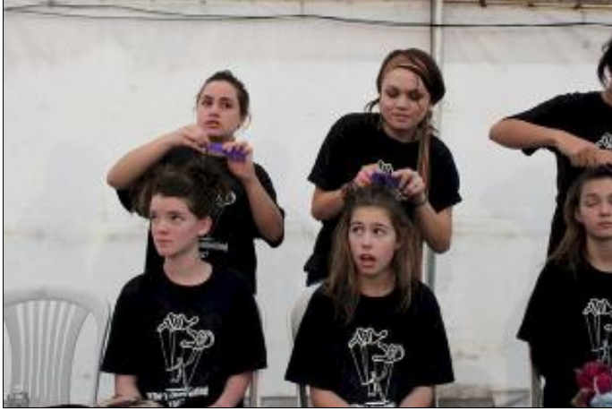
The preparations begin