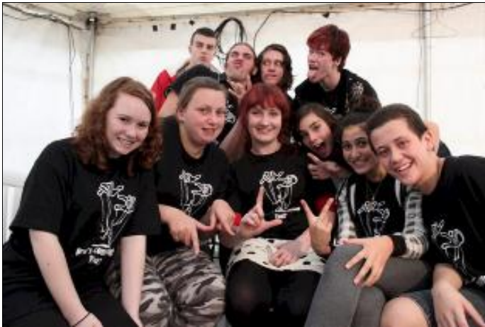
Time for relaxing