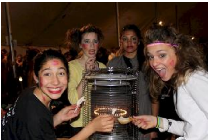
A quick snack to revive the energy