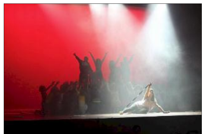
Awesome finale to a great performance