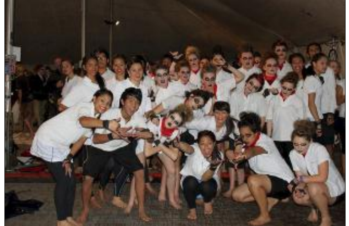
Melville's Stage Challenge 2011 team