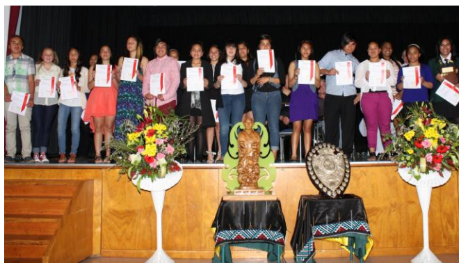
Mangakōtukutuku Kapa Haka Group winners of the Melville High School Performance of the Year Award