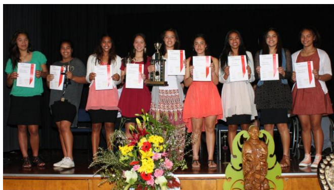
Senior Girls' Basketball Team Sports Team of the Year