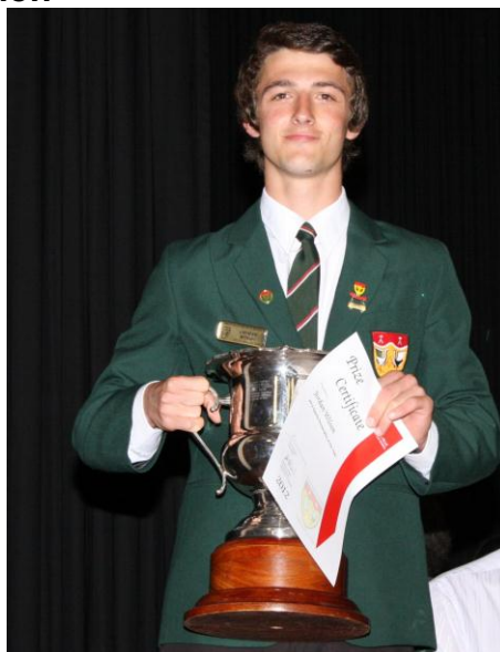
Jordan Sports Personality of the Year