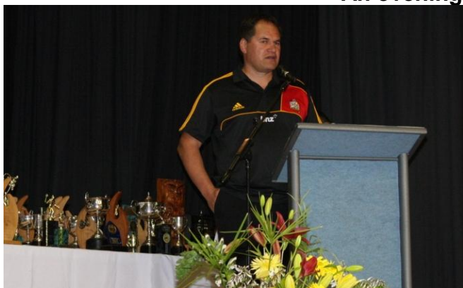
Guest Speaker, Dave Rennie Head Coach of Chiefs Rugby Team