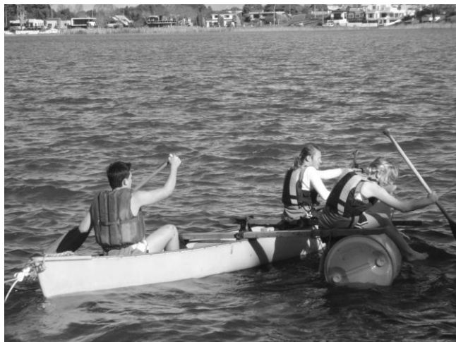
Hamilton Lake challenges

On Tuesday 21 August, 16 students from the Year 9 and Year 10 Institute of Sport classes participated in the Get2Go Challenge. This event was organised by The Sir Edmund Hillary Outdoor Pursuit Centre and is a multi-sport race that is similar to The Amazing Race. Twenty four schools assembled at the Hamilton Lake at 9am and were given a map and outline of the day. From there teams were driven around four locations throughout the day that had students complete challenges involving kayaking, mountain biking, orienteering and problem solving adventure based learning activities.