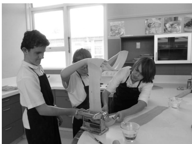
Year 9 students making pasta