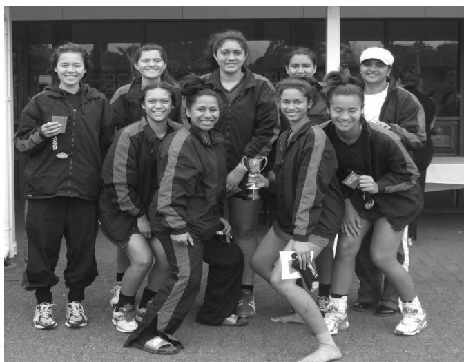
Hamilton City Secondary School Premiere winners 2012

Senior Premiere Winners Senior B Runners Up Intermediate 5 th Place Junior Premiere 3 rd Place Junior Pool 3, 6 th Place