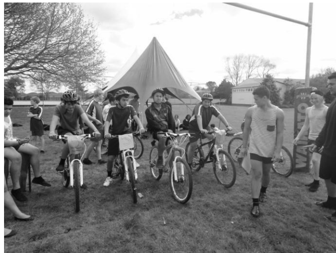
Year 11 MTB race

All students involved in this programme have been actively involved in leadership units this term. The Year 9 classes have completed a coaching programme that was directed at improving the skill levels in a range of sports for their peers. Our Year 10 class has completed a Level 1 Achievement Standard that required them to plan and carry out the management of a Duathlon race for Year 13 PE students to compete in. The Year 11 class has completed their Event Management assessment which had them planning and carrying out a Mountain Bike race for the Year 9 class. And finally, the Year 12 class has completed their sports coaching assessment that required them to coach Year 9 classes over the course of a month. I have been impressed with the knowledge that our senior students have been able to pass down to the younger students throughout these units of work.