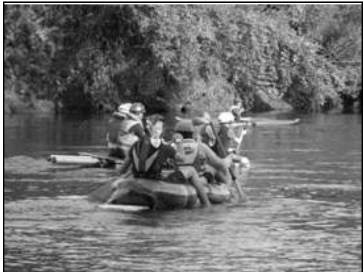
Great memories of Melville's 2009 raft race

Rafts depart from The Narrows boat ramp at 9.30 am. The trip lasts approximately two hours and concludes with a barbeque at the Grantham Street boat ramp. Families are encouraged to assist and support their children in the construction of rafts.