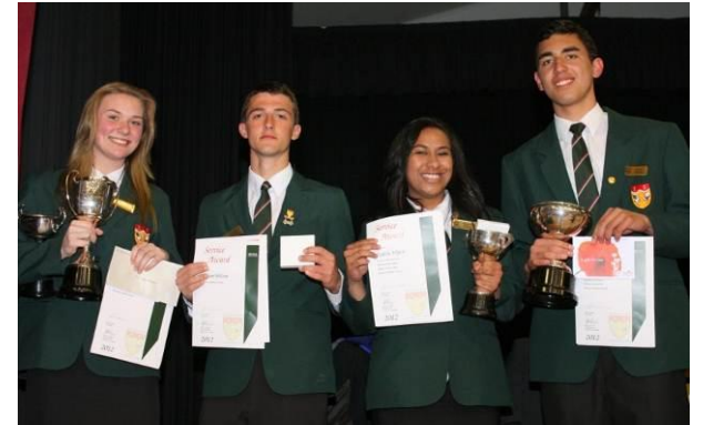
2013 Student Leaders recognised for their contribution to school