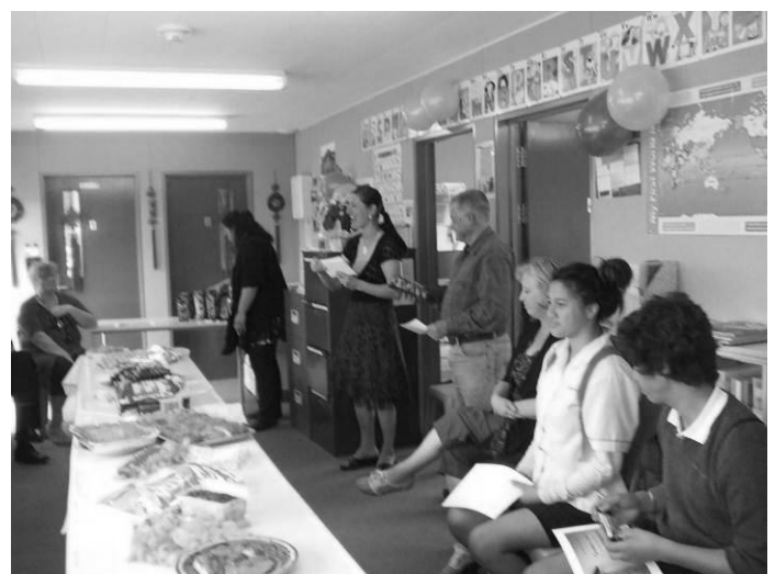
Students and tutors celebrating their successes

A celebration was held in the last week of school where students and tutors were given certificates to acknowledge their efforts. We are very grateful to the tutors who gave up their time.