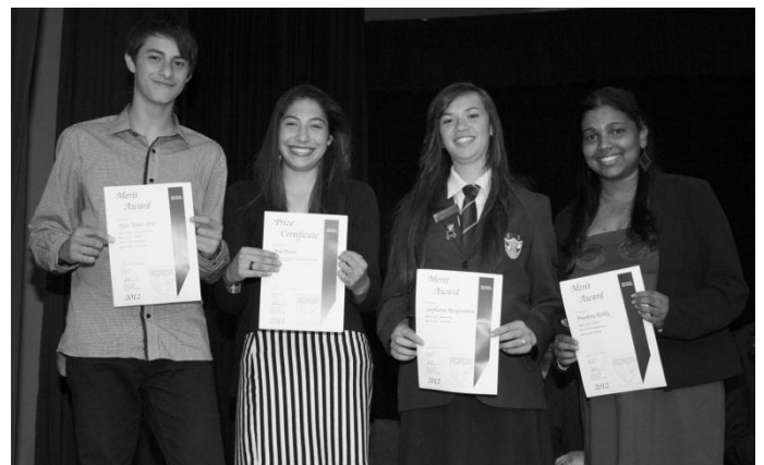
Senior prizegiving award winners