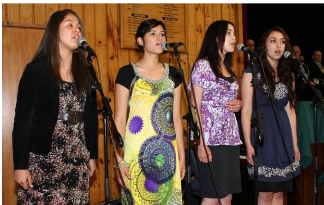
Melville High Girls' Barbershop Quartet enthraling the audience with their beautiful performance