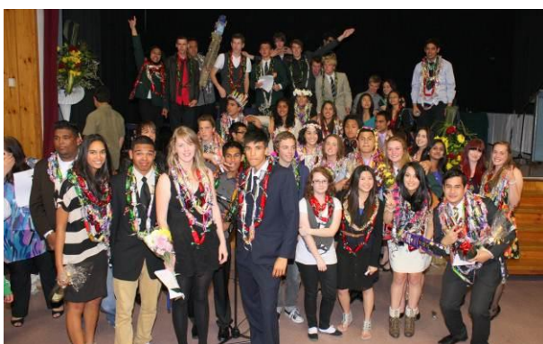
Year 13 students celebrate their final year at Melville High School