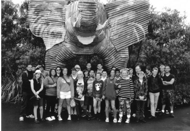
At the Auckland Zoo