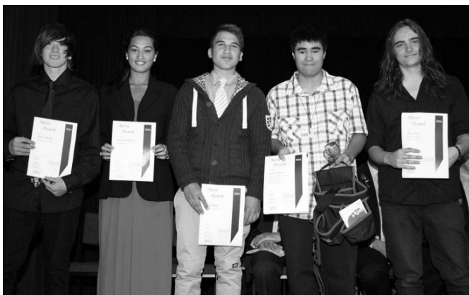
Senior students with their awards