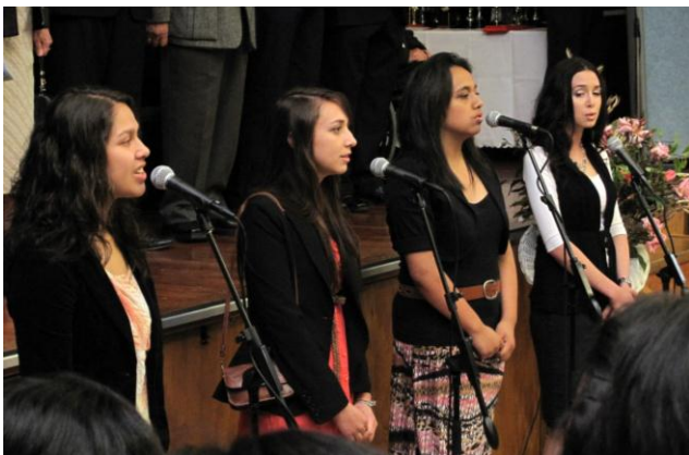
Girls' Barbershop Quartet singing the National Anthem