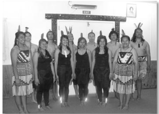
Super 12 Group