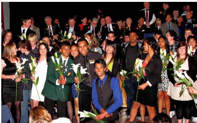
Year 13 students celebrate their final year at Melville High School