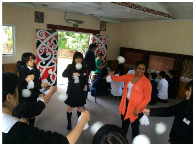
Performing with poi in the school marae

The purpose of the trip was to learn English and experience New Zealand culture, with all the students staying with Kiwi families.