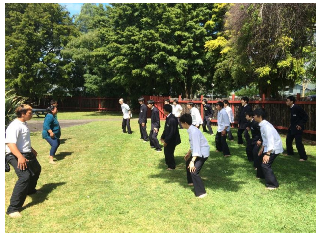
Learning the haka

The students all had a great experience, trying many Kiwi things such as Marmite and L & P!!