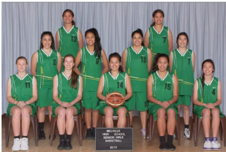
Senior Girls' Basketball Team

The Senior Boys' and the Senior Girls' Basketball teams are off to play in the Secondary School National Basketball tournament in Palmerston North all next week. The teams will be playing in the "A" grade for schools with a roll of less than 600.