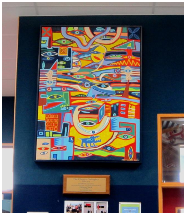
Neighbourhood Safari displayed in the Glenice Gallagher Library

Neighbourhood Safari is a vibrant, busy and colourful piece of work which has added a new dimension to the Glenice Gallagher Library. It engages observers and has a myriad of features and stories within the large canvas.